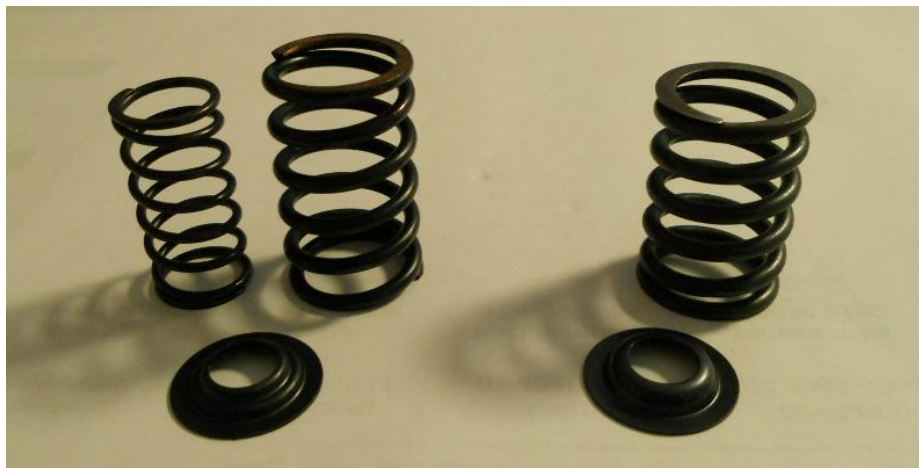
Figure 4 - New double valve spring vs the previous single spring configuration