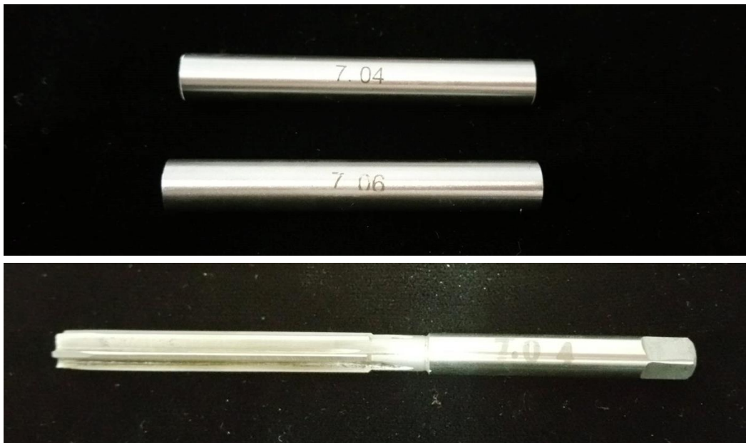
Figure 1: Valve guide Go-No go gauges and hand ream (available as a kit from Jabiru Aircraft)