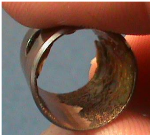
Figure 3: Badly worn rocker bush.