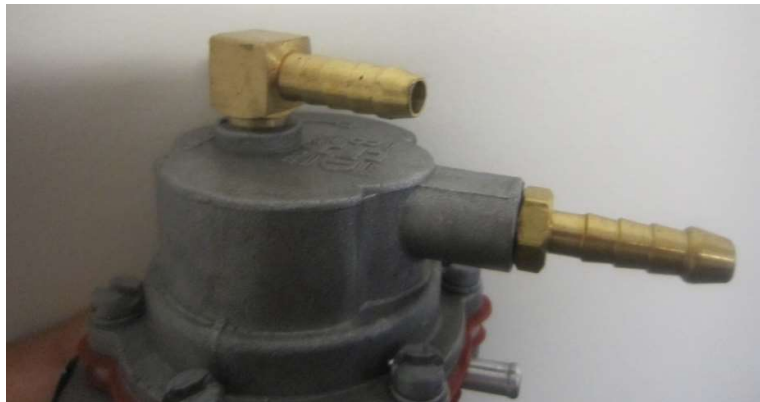
Figure 3: Pump with both fittings screwed in. (No further inspection required)