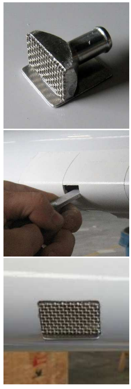
Wednesday, March 4, 2009

Apply 5-Minute Araldite and flock to the bottom and sides of the stall warning assembly and carefully slide it back into the wing until the gauze is flush with the leading edge of the wing and leave to cure. Remove the protective cloth tape.