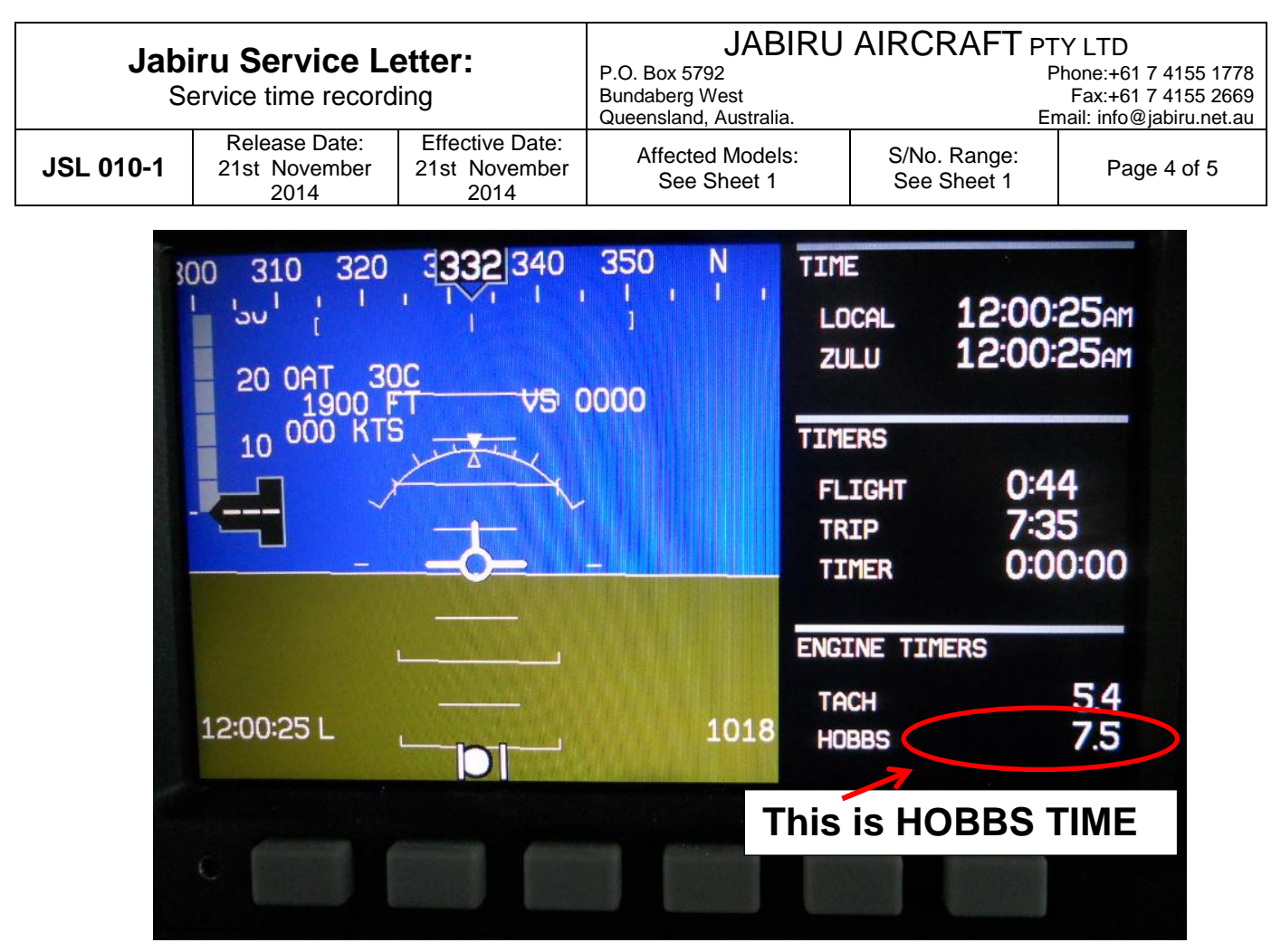
Figure 3 - Dynon D180 EFIS