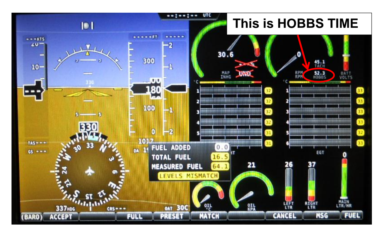
Figure 2 - Dynon SkyView EFIS