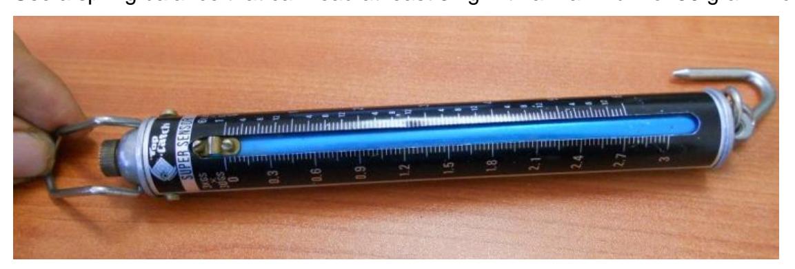
Figure 4: Suitable spring balance.

• Use a spring balance that can read at least 3 kg with a maximum of 50 gram increments.