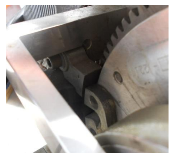
Figure 3: Coil position.

• Use a spring balance that can read at least 3 kg with a maximum of 50 gram increments.