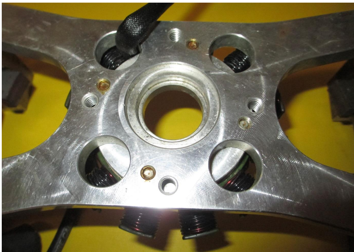
Figure 2 - Back of overheated Alternator Stator