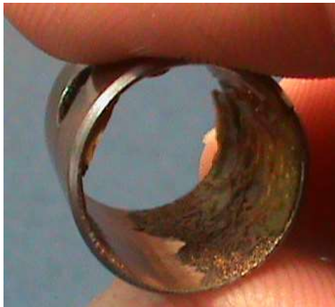
Figure 3: Badly worn rocker bush.