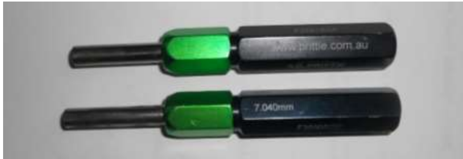
Figure 1: Go-No Go Gauges