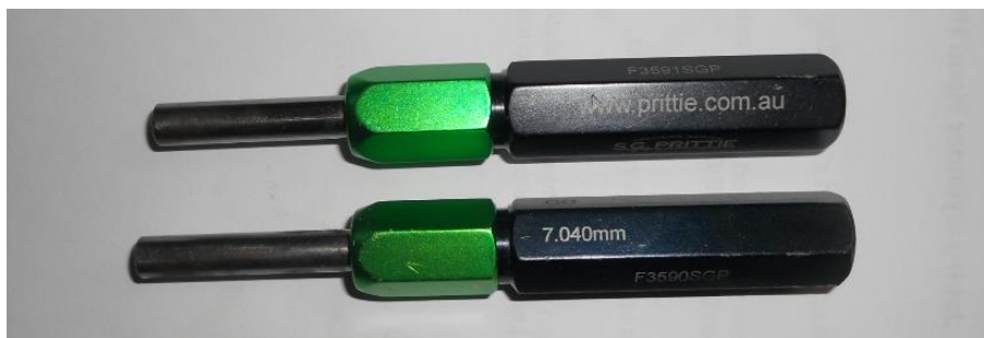
Figure 1: Go-No Go Gauges